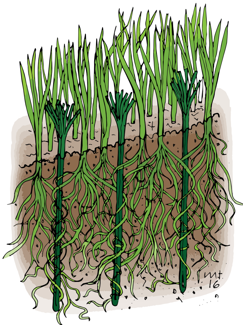
Figure 1: Example of a common hybrid method. Polypropylene fibres (dark green) are inserted 200 mm deep into a sand-based rootzone of a natural grass playing surface to provide shear stability and durability.

feet. Extremes in traction (too low/high) or surface compliance (too soft/hard) incur biomechanical adjustments by the player that may directly increase the risk of lower extremity injury – via high traction at the shoe-surface interface 5 for example, or indirectly through fatigue, which may be affected by surface compliance or energy absorption 6 .