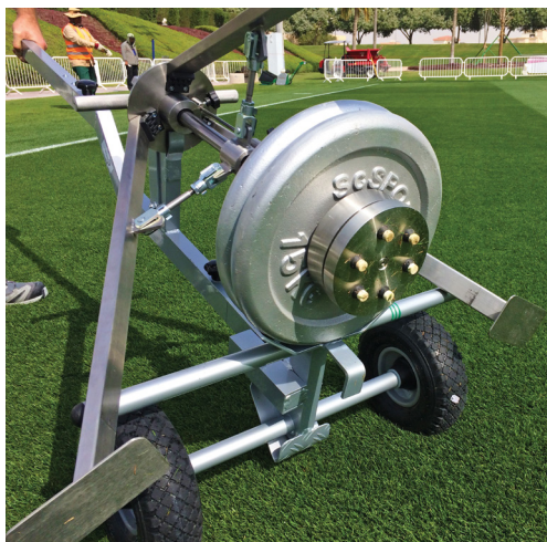
Images Top: FIFA-approved studded disc apparatus used to measure rotational resistance (traction) via a two-handed torque wrench.